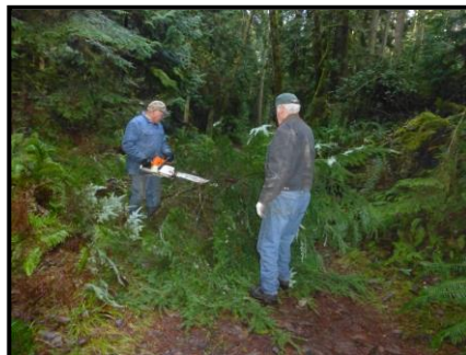
Vegetation cleared from trail