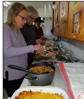
Members focus on the food line!