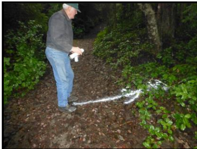
Tom Marks trail