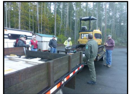
Safety Meeting to begin the day