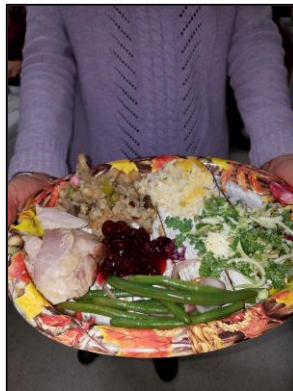
Delicious Turkey Dinner!