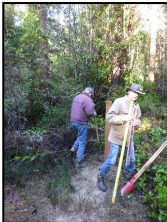
Set and Level the post