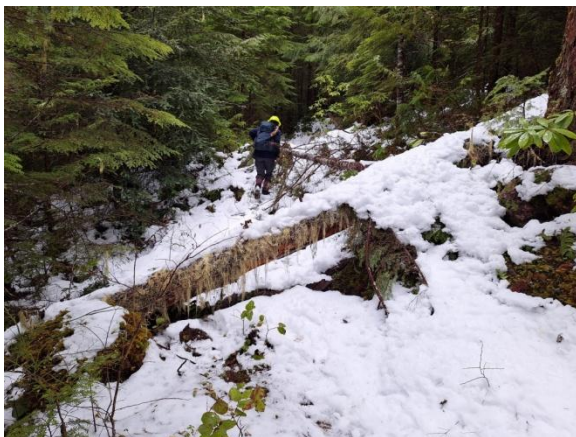
5) & 6) 50' above 4)