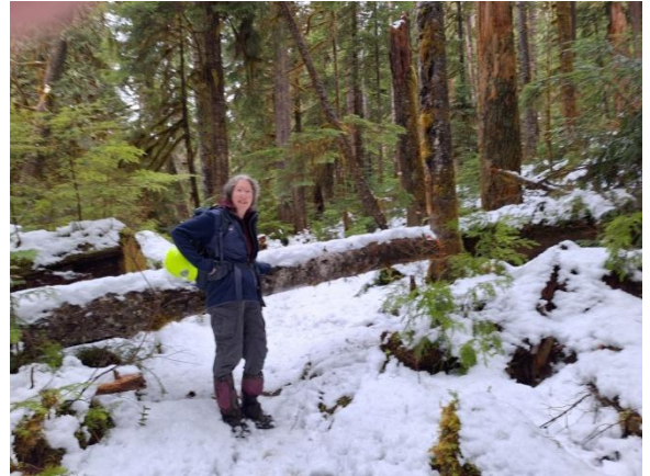
2) ~1/2 mile below Camp Jolley