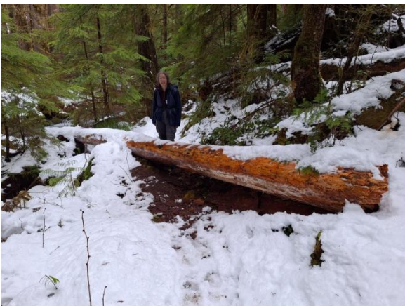
3) 50' up trail from 2)