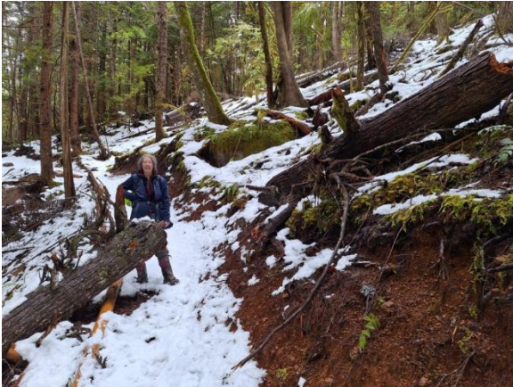
1) On reroute