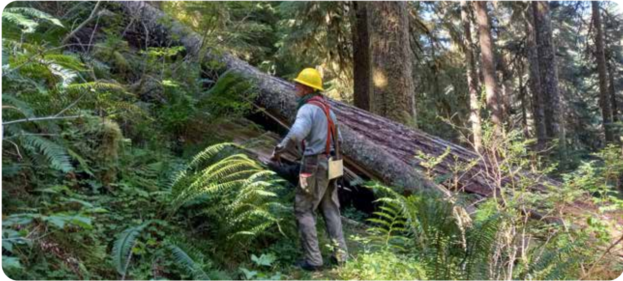
Back Country Horsemen and Evergreen Mountain Bike.