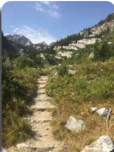
Rock stairs on the way to Holly Lake, Grand Tetons