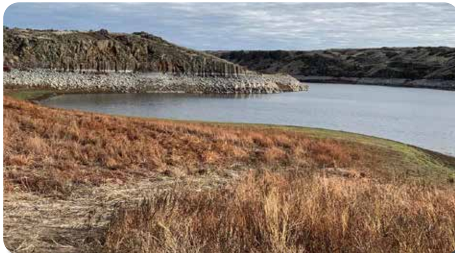
Pacific Lake is across from the Lakeview Ranch Trailhead.