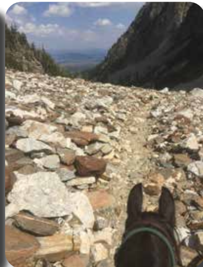
Rock trail on the way down from Holly Lake, Grand Tetons.