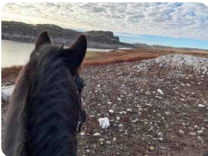
Carol Klar's horse Onyx looking out at Pacific Lake.

road and a short jaunt over to look at Pacific Lake. Our favorite loop was 10 miles out and through a barb-wire gate and around a picturesque loop on an ORV trail (there were no vehicles around). The third route, which we explored on foot, was a trail that we think eventually connects to Odessa, but we haven't been the full length of that 13-mile trail, yet. There are some other potential trails and areas that we still need to explore.