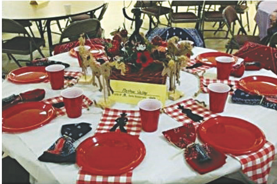
Table Decorating Contest