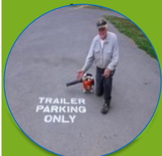
New Parking Lot Signs June 21, 2021

Back Country Horsemen of Washington (BCHW), is a 501