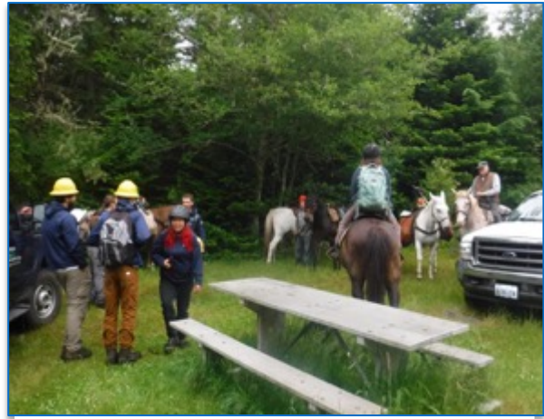
Trail Crew Meeting Pack Stock