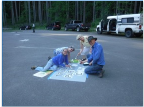
Painters at work.