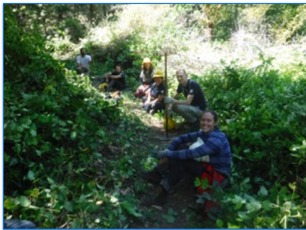
Short Break Along Cable Trail