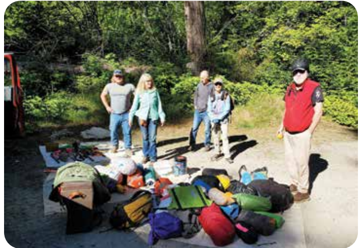
Black Piner Photos.