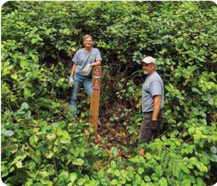
Finding signs hidden deep in the vegetation