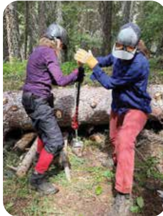
A high-lift jack is used to hold the log up so it doesn't pinch the saw or helps lift it clear of an obstacle so it can be rolled off the trail.