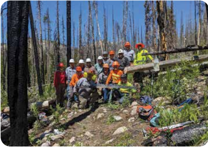
Hot Shot Crew