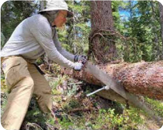
An under-bucker holds up the saw so the log can be cut from underneath.