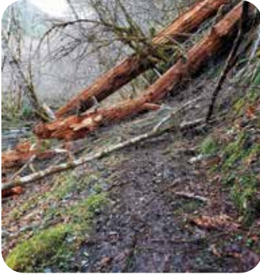
Our first project, 20 yards past