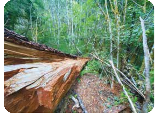
Detached rootball means great sliding potential

By Rebecca Wanagel, BCHW Peninsula Chapter