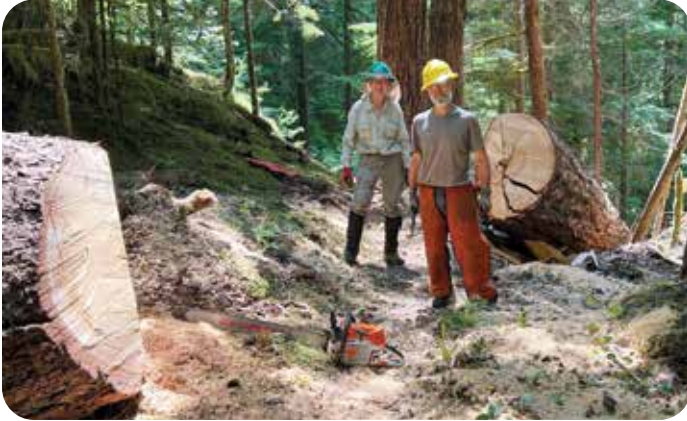
This was the five-log mess about three miles south of Hayes.

For details, visit https://www.bchw.org/trail_crew_reports.php