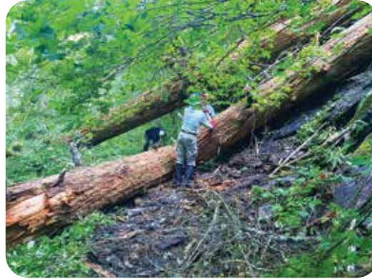
South horse gate out of Elkhorn.