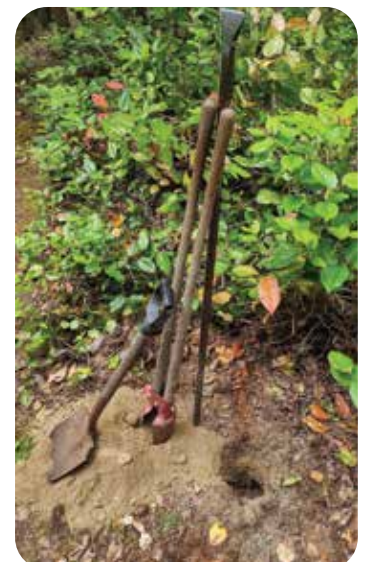
Tools of the trade