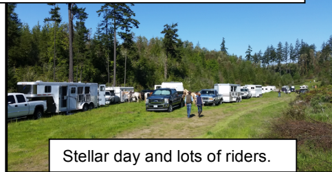
Stellar day and lots of riders.