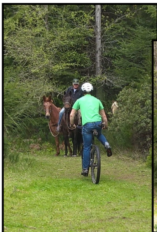
Powel Jones encounters Tom Mix on horses