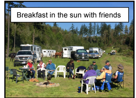
Breakfast in the sun with friends