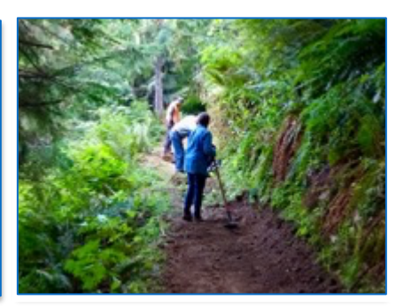
showing bridge & culvert work and effort to regain tread along the OAT.

Olympic National Park: We lent an ONP packer key equipment to haul 50 bags of sakrete to a job.