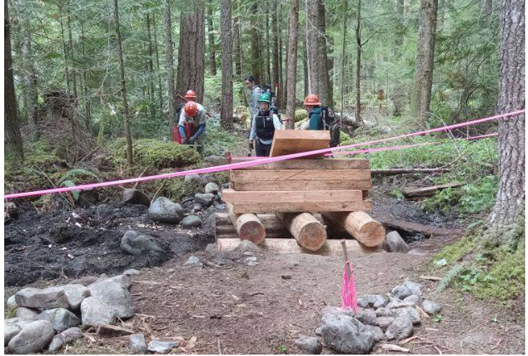
Work completed by WTA.