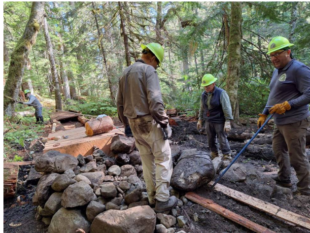
Near end of Sept 21.