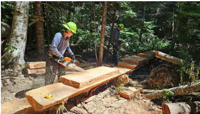
Trimming the edges off the finished planks.

A very cool part of today was that some of the Gray Wolf Crew taught some of the youth how to run the saw mill and they got to make some planks!