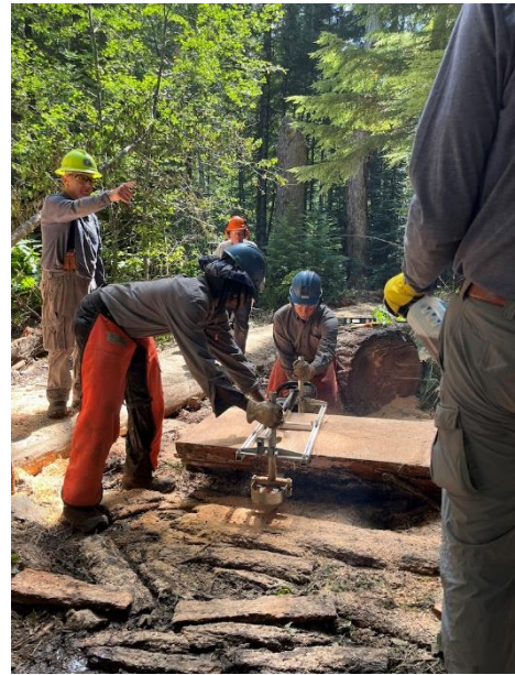
Youth Corps on the saw mill!