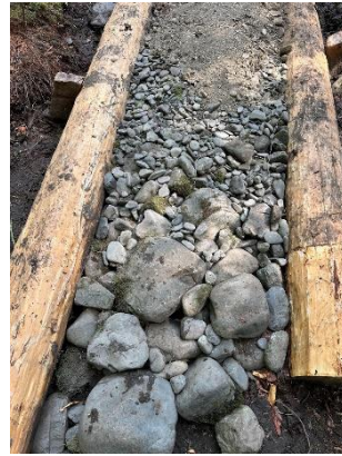
This was built correctly. This picture of their actual turnpike matches the section drawing I gave them out of the Lightly On Land book that shows a turnpike constructed with large rock on the bottom, decreasing to cobble size rock and finally tamped and mounded fill on the top. Because they built this correctly, it will easily stand up to bikes, horses and countless hikers and runners.