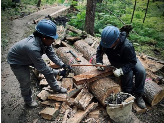
They learned how to make stakes out of old puncheon decking.