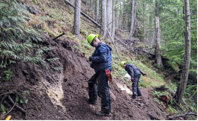
Left: Nice cut! One more to go. Right: I heard later that watching the rootball roll was super fun for the crew. They look pretty nonchalant here. Preparing for tread restoration.