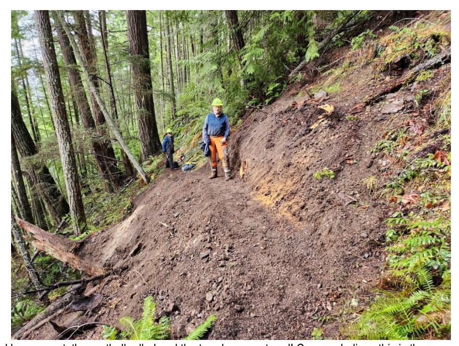
Second log was cut, the rootball rolled and the tread was restored! Can you believe this is the same spot??