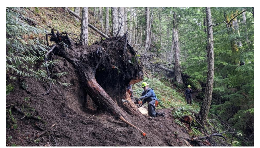
A great action shot of Randy at work! You can really see in this picture how much clearing the team had to do on both of the logs. The one in the foreground used to be buried but is now wide open.

Right: Randy cutting the first of the two trees that needed to be cut. This one had to come first because of the direction the rootball was going to roll. This one was on the downhill side of the roll, with the other tree still holding the mass in place. So this was safe to do.